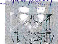
Tank Weigh Bridge