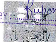
Tank Weigh Bridge