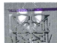
Tank Weigh Bridge