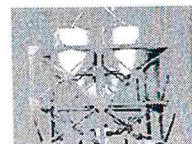
Tank Weigh Bridge