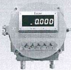
DF-451 Flame Proof (FLP) Console