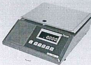
DS-450N Table Top Scale