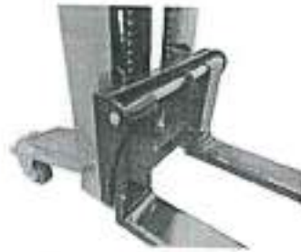
Heavy Duty Adjustable Fork