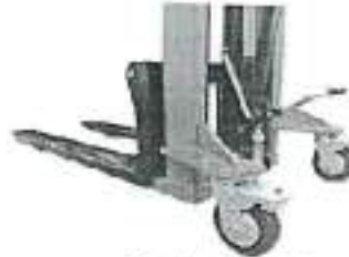
Dual braking System