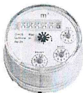
Common Plastic Register