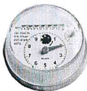
Full Glass Register