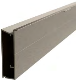
Brushed Stainless Steel